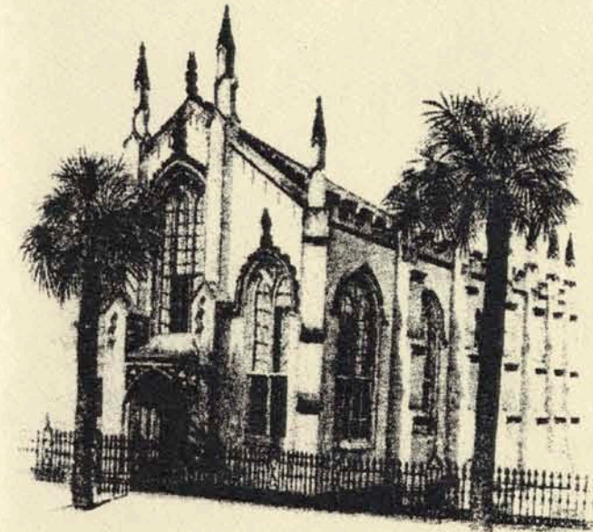
The Huguenot Church

Charleston, South Carolina May 17-20, 2000